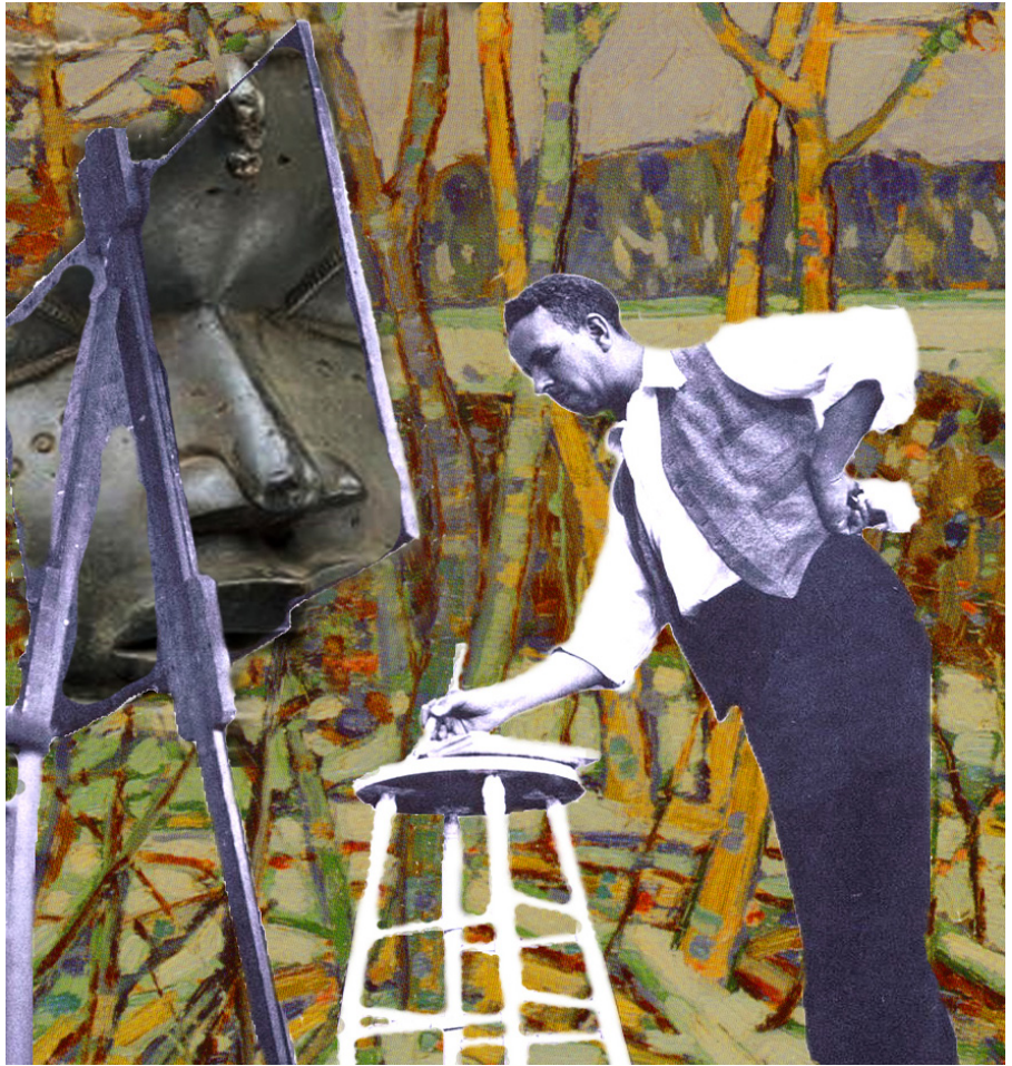
Hale Woodruff (detail), digital collage, 48x32, 2015

We gratefully acknowledge the support of our funders, sponsors and the individual donors who make our programs possible. The Geraldine R. Dodge Foundation, The New Jersey State Council on the Arts/ Department of State, a Partner Agency of the National Endowment for the Arts, The Union Foundation, The New Jersey Council for the Humanities, a state partner of the national endowment for the Humanities Hunterdon Brewery, and RBH Group.