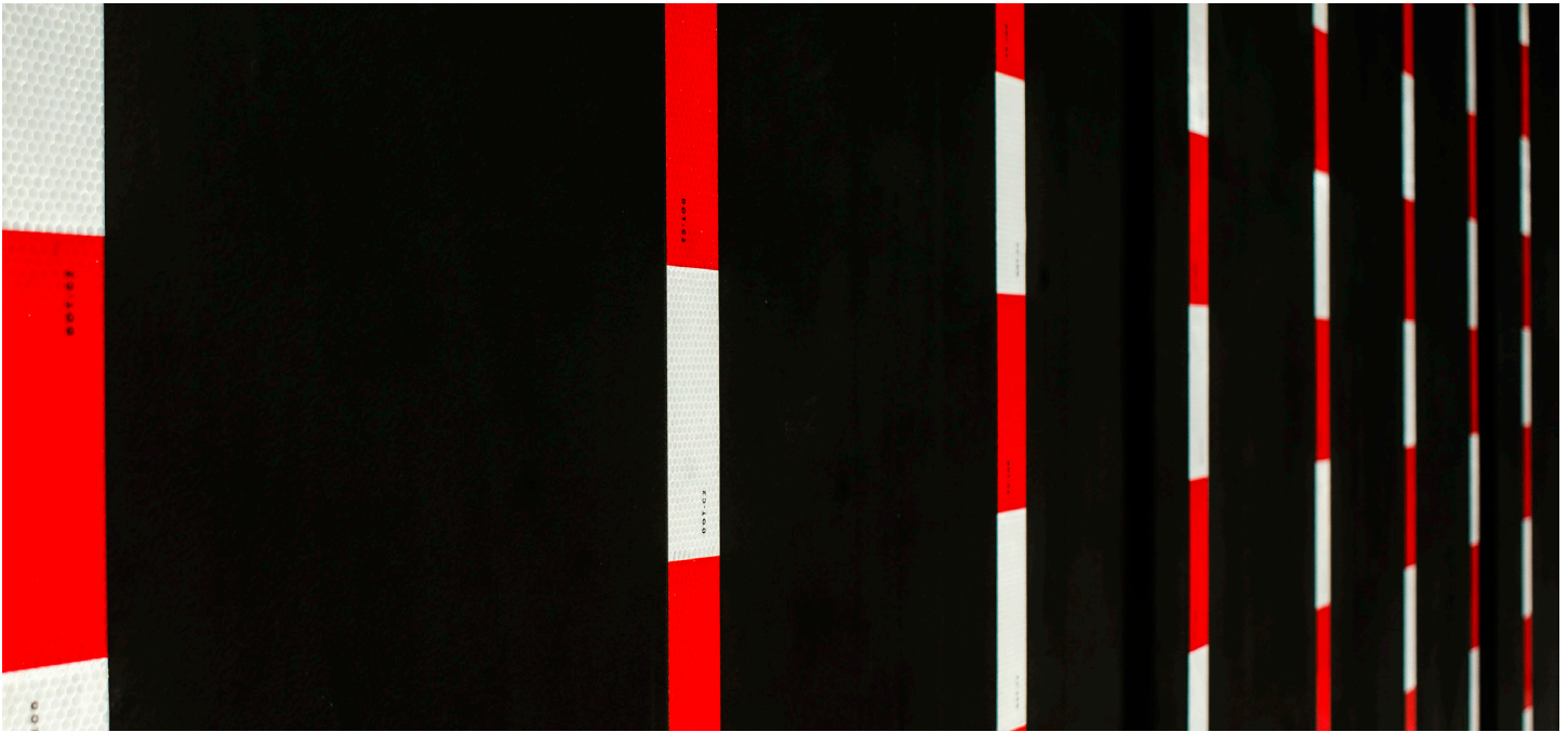
Groove Alley (detail), tape on wall, dimensions variable, 2016